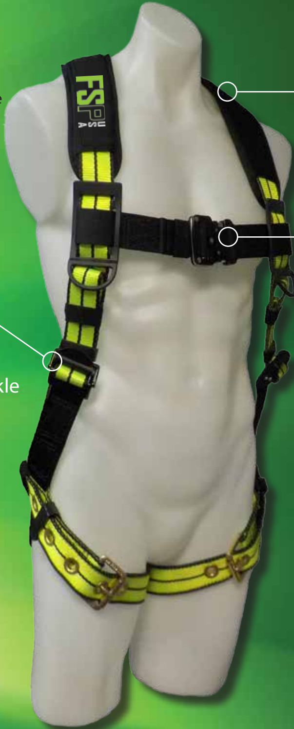
2nd Skin Shoulder Pad